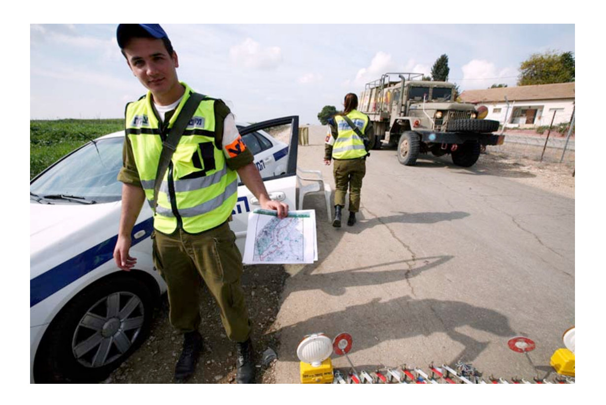
Figure 3: An Israeli military policeman shows the "Closed Military Order" map at his roadblock, complete with spikes, outside Kibbutz Ni Am, across the street from Sderot, 19 January 2009.

restrictions on the media entering Gaza implemented from early November 2008 onwards.<sup>5</sup>