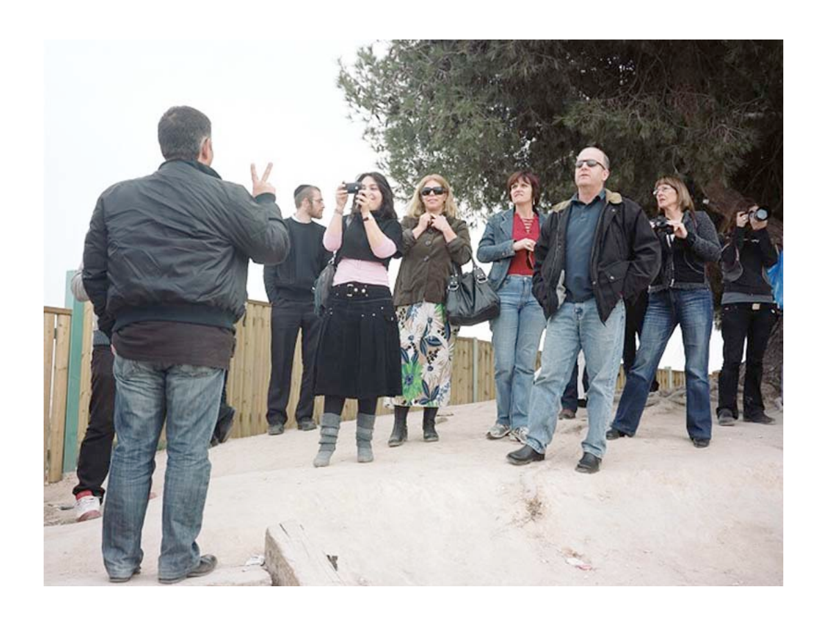
Figure 4: Israelis gathered on a hill near Gaza to see the "show" during one of the last days of bombing by the Israeli Air Force, January 2009.