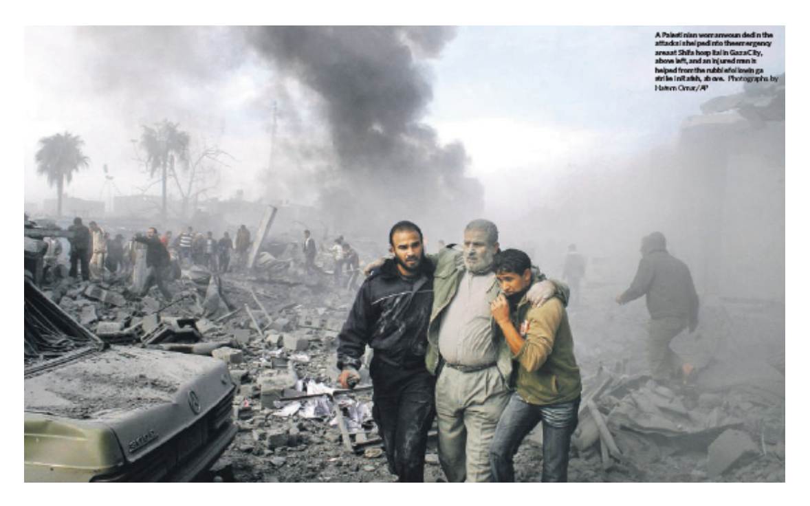
Figure 7: The Observer , 28 December 2008, 2-3. Caption: "...an injured man is helped from the rubble following a strike in Rafah, above."

In the first few days of the war The Guardian used photographs that showed individuals caught up in the destruction of their urban environments (Figure 8, which appeared large format on page one) before moving to devastated landscapes to signify the scale of destruction that was on-going (Figure 9). The first image of the IDF did not appear until 31 December, when a large photograph of Israeli tanks with their crews relaxed was used (Figure 10). This was juxtaposed on the page with a small picture of a Palestinian boy getting hospital treatment (Figure 11). The juxtaposition of images became more frequent as the conflict went on. For example, the photograph of the bombed-out apartment block (Figure 9) was flanked on the left by a picture of two Israeli women – this was the first image of Israeli's in The Guardian , and showed them with their hands clasped over their mouths in fear after a rocket attack (Figure 12) – and on the right by a similarly sized photograph Palestinian victim whose body was wrapped in a flag awaiting burial (Figure 13). Juxtaposition was also evident in the photomontages the paper used to summarise the conflict (Figure 14).