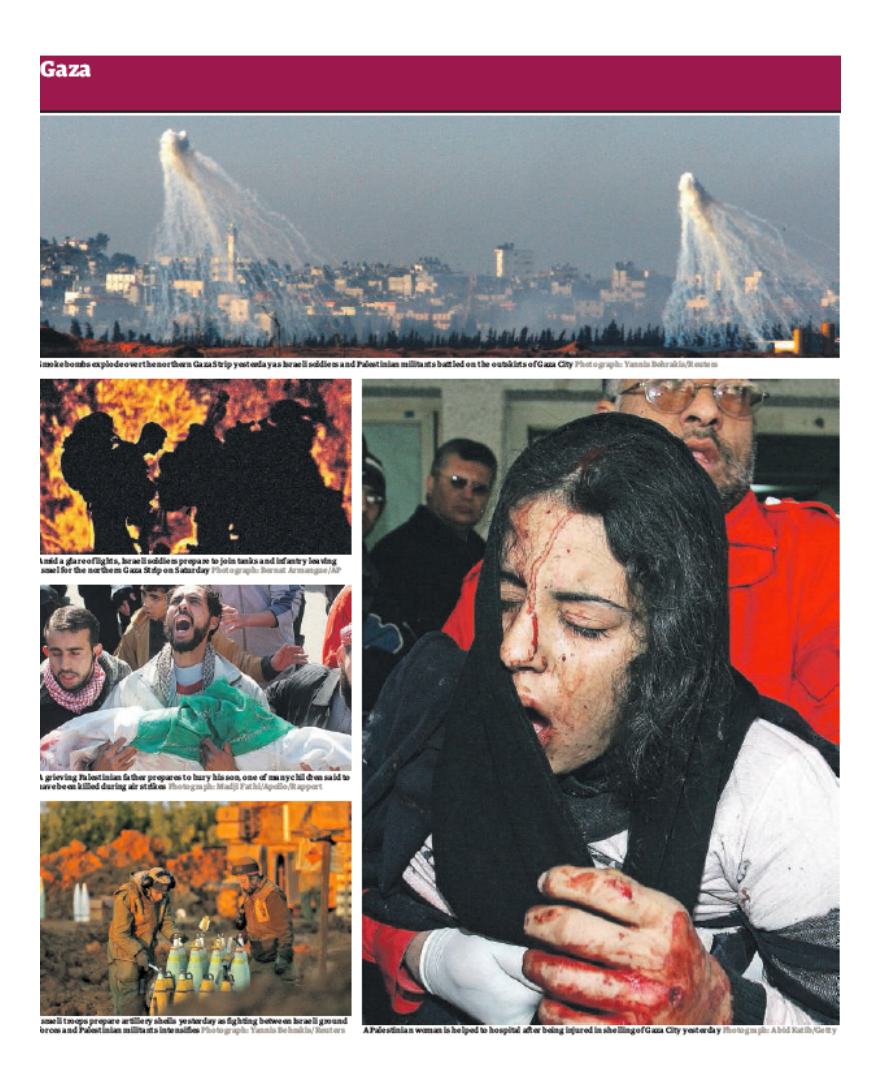
Figure 15: The Guardian, 5 January 2009, 4.

offered ample evidence of large-scale urban destruction in Gaza and widespread casualties. With the summary montage of the conflict (Figure 14) dominated by a picture of a lone Palestinian child in the rubble of a Rafah mosque destroyed by an Israeli airstrike, the paper's perspective would appear to have been materialised in the size and subject of this image. Representing Palestinians generally, the boy is presented as the victim of a devastating military power against which he can offer little resistance. It follows on from an earlier presentation of photographs in which a large image showing the wounded corporeality of a Palestinian woman was contrasted with smaller pictures of the clean, remote, cyborg-like qualities of the IDF (Figure 15).