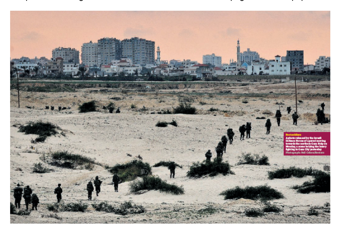
Figure 18: The Guardian 14 January 2009, 14-15. Caption: "Foot soldiers. A photo released by the Israeli Defence Forces of a patrol moving towards the northern Gaza Strip on Monday, a scene belying the heavy fighting in Gaza City yesterday. Photograph: Neil Cohen/Reuters."

this picture of "alleged Hamas militants" which featured on page one of the paper