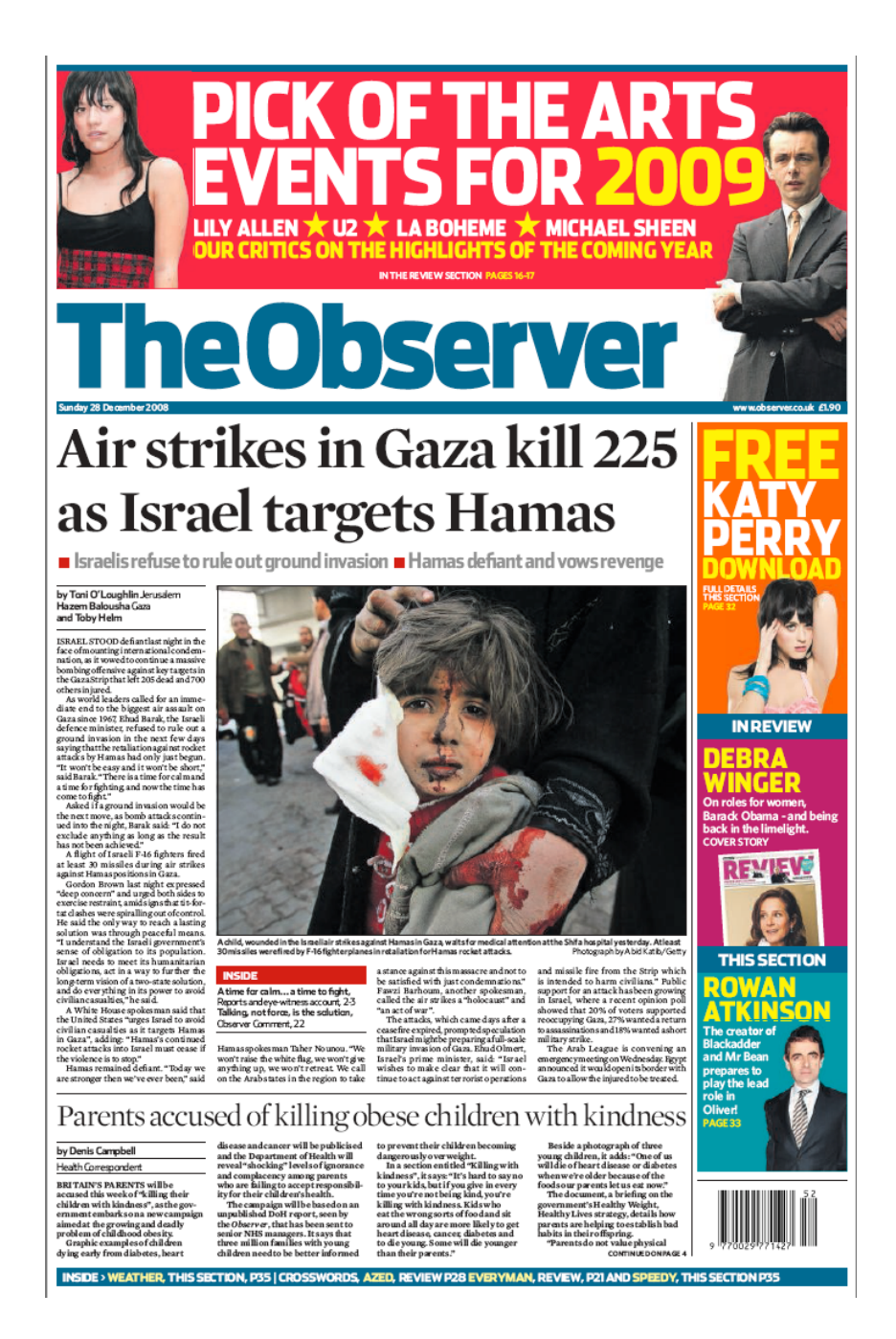
Figure 6: The Observer , 28 December 2008, 1. Caption: "A child, wounded in the Israeli air strikes against Hamas in Gaza, waits for medical attention at the Shifa hospital yesterday. At least 30 missiles were fired by F-16 fighter planes in retaliation for Hamas rocket attacks."

The Observer opened its photographic coverage of the Gaza war with a familiar image of conflict showing a young girl, her face darkened by dried blood and dust from an airstrike, being comforted as she waited for hospital treatment. The picture editor of a competitor paper (Sophie Batterbury of The Independent ) later