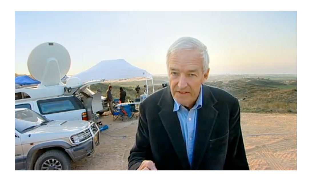
Figure 1: Jon Snow, Unseen Gaza, 22 January 2009, screen grab.

Israel's three-week war against Gaza was a devastating assault, resulting in the death of some 1,300 Palestinians and the destruction of thousands of buildings. The story of this military operation dominated the world's media in January 2009, yet many felt that the reality of the conflict had been hidden from a global audience because of Israel's exclusion of the international media from Gaza. This view was detailed on British television in a Channel 4 documentary entitled "Unseen Gaza." Beginning with the documentary's approach to the issue of how conflict should be covered, this paper explores the photographic enactment of Israel's war on Gaza in January 2009, using the pictorial coverage of The Guardian and The Observer as the principal source. The purpose of this analysis is to consider whether the humanitarian visualization of Gaza and its inhabitants provides a compelling account of catastrophe in a zone of permanent emergency, and what this issue means for how we understand the photography of conflict, crisis and catastrophe.