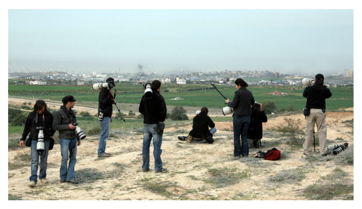
Figure 5: "Wire service" photographers on a natural lookout over the Gaza Strip...Shortly after this photo was taken, the photographers left because a military jeep was making its way towards them to eject the group for being in an officially "closed military area."