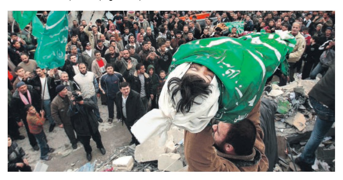
Figure 16: The Guardian , 30 December 2008, 1. Caption: "A relative holds up the body of one of the five girls killed when a bomb targeted at a mosque destroyed her family's home. Photograph: Mohammed Salem/Reuters."

assault on Gaza in forty years, funerals would have been emotive events consistent with the premises of international media assumptions. Nonetheless, a page one photograph from such an event (Figure 16), portraying a relative holding a deceased girl aloft, shows a passive crowd. As such, other photographs portraying public grief can be read in ways that conform to orientalist understandings of the 'emotional (and hence irrational) Arab' (Figure 17).