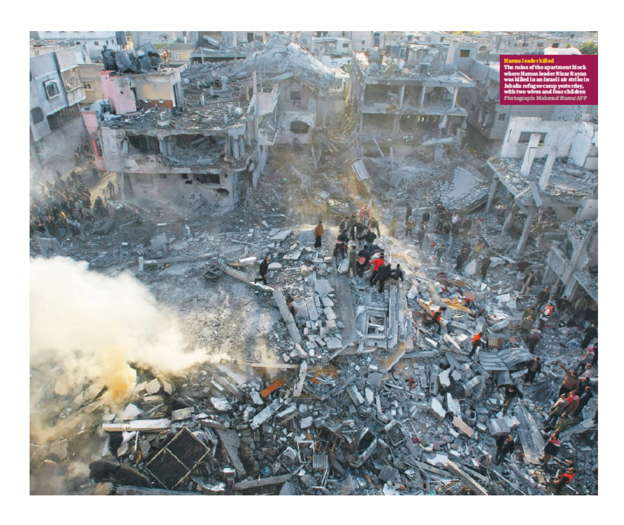
Figure 9: The Guardian , 2 January 2009, 16-17. Caption: "Hamas leader killed. The ruins of the apartment block where Hamas leader Nizar Rayan was killed in an Israeli air strike in Jabalia refugee camp yesterday, with two wives and four children. Photograph: Mahmud Hams/AFP."