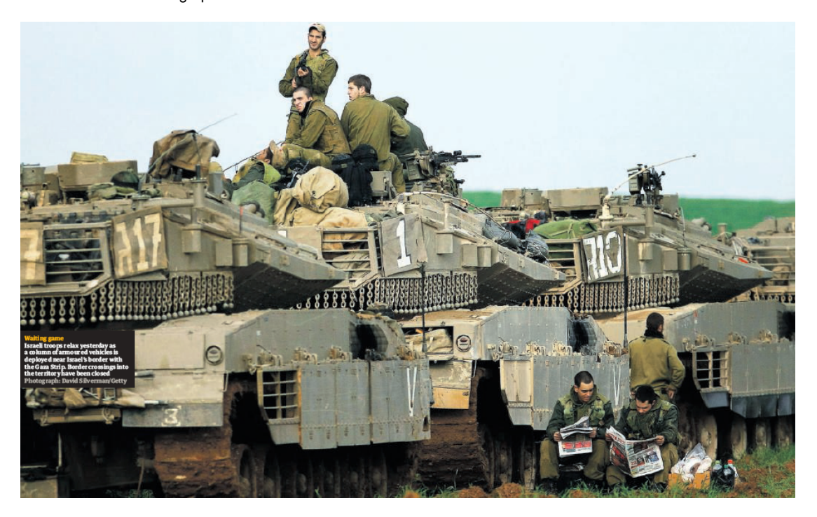
Figure 10: The Guardian 31 December 2009, 4-5. Caption: Waiting game Israeli troops relax yesterday as a column of armoured vehicles is deployed near Israel's border with the Gaza Strip. Border crossings into the territory have been closed."