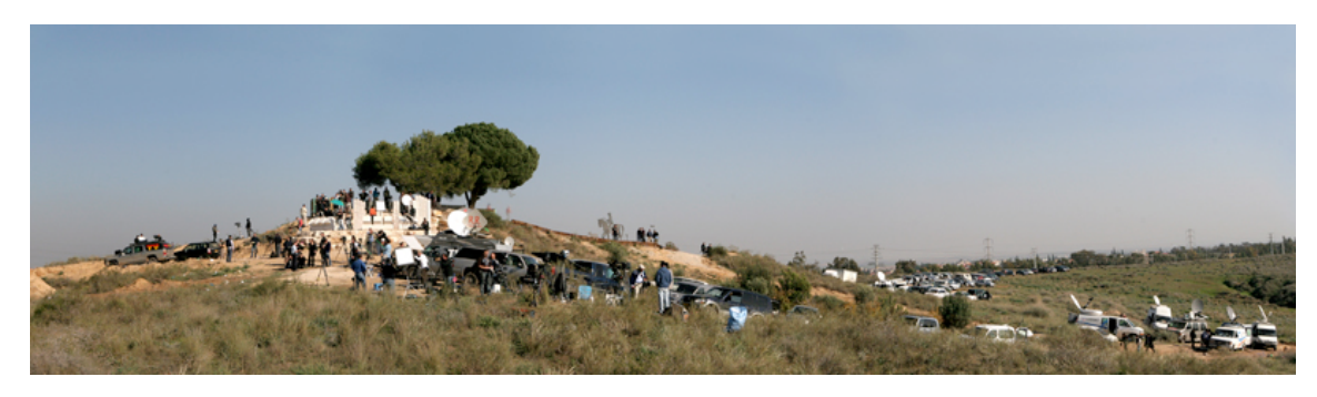
Figure 2: The Journalist Hill, 7 January 2009.

Presented by Jon Snow, "Unseen Gaza" detailed how foreign reporters were kept away from Gaza and corralled on a hilltop some 75 minutes south of Jerusalem from where they peered into the occupied territory. This location was some distance from the Israel/Gaza border because the IDF had declared a 2-4 kilometre wide strip of territory in southern Israel contiguous with Gaza to be "closed military zones." On this hillside beyond the closed zone journalists were closely monitored by the military and the police, making it difficult to even observe the remote traces of conflict (the sound of artillery, the streaks of aircraft and the sight of smoke rising from the targets). One reporter interviewed in "Unseen Gaza" called it the "Hill of Shame" because of the restrictions that placed them there, and the "Hill of Same" because of the way the location homogenized all news coverage emanating from there.