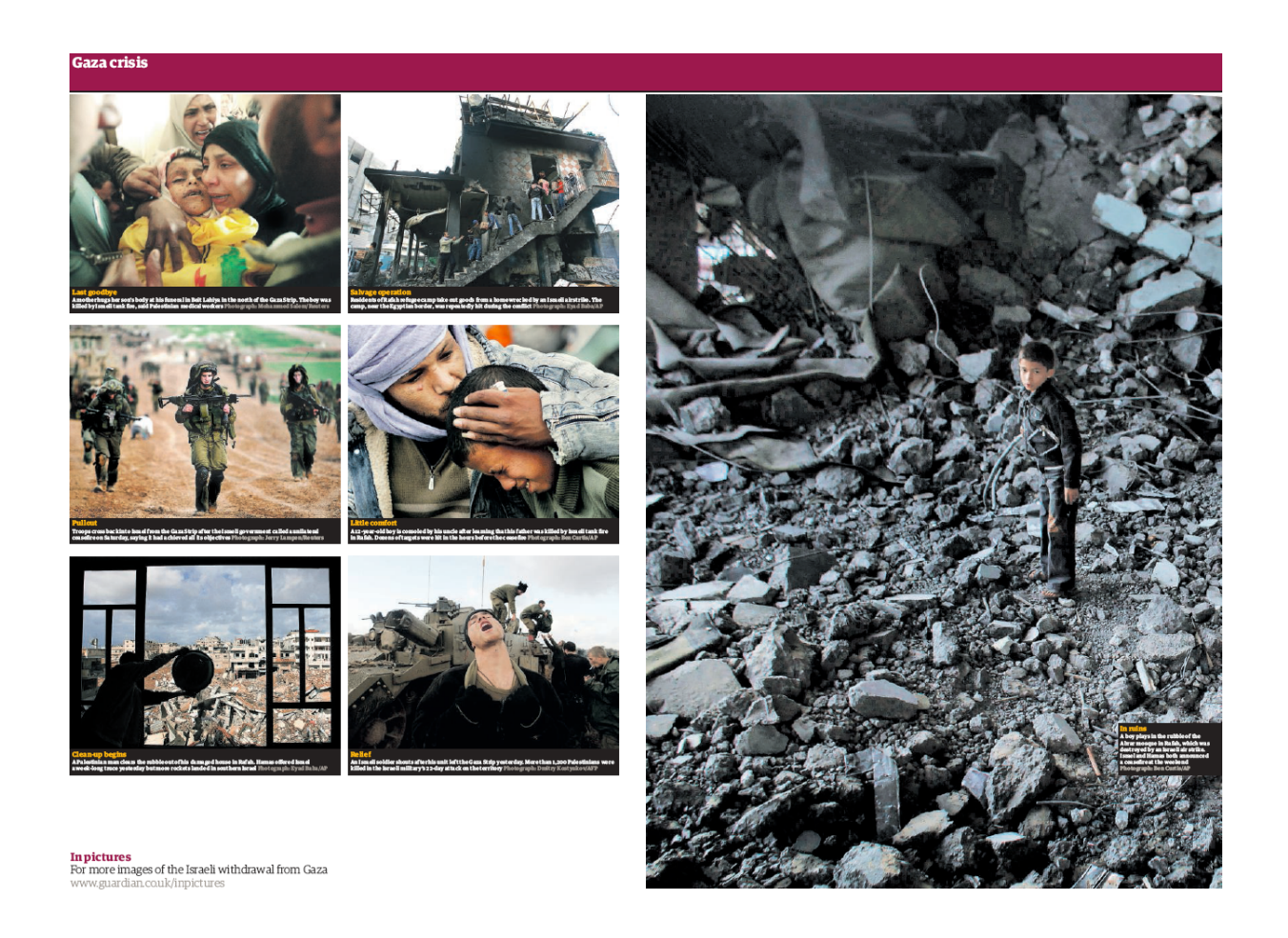
Figure 14: The Guardian, 19 January 2009, 18-19.