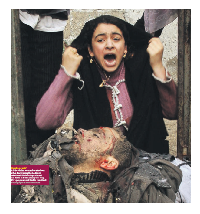
Figure 17: The Guardian , 9 January 2009, 18-19. Caption: "Shock and grief. A Palestinian woman breaks down after discovering the bodies of relatives killed during an Israeli air strike in Beit Lahiya yesterday. Five people were killed in the attack."