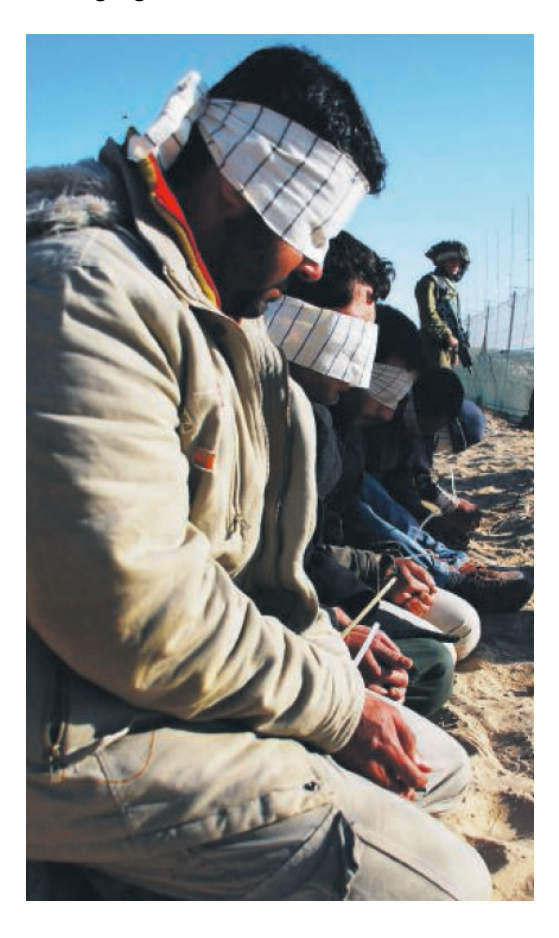
Figure 19, The Guardian , 9 January 2009, 1. Caption: "A picture issued by the Israeli Defence Forces shows alleged Hamas militants under guard after being captured in the Gaza Strip. Photograph: Getty Images."

emerging from within Gaza itself – we have the production of Palestinians as