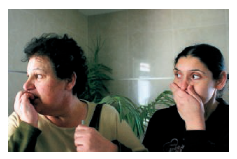
Figure 12: The Guardian , 2 January 2009, 16. Caption: "Israelis minutes after a rocket attack yesterday. Photograph: Uriel Sinai/Getty."