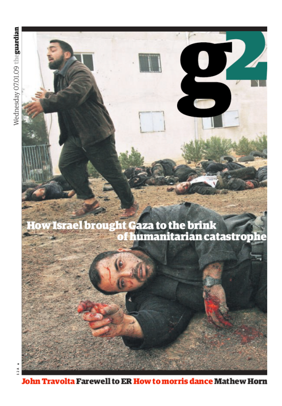
Figure 24: The Guardian G2, 7 January 2009, cover.

The idea that Gaza is "on the brink" of catastrophe is common to much media coverage (Figure 24). In one account during the conflict, it was reported that "much